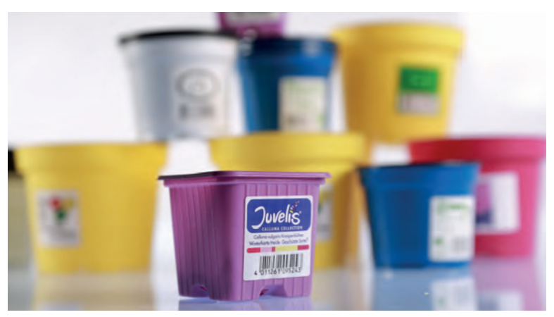
Self-adhesive identification labels for gardening