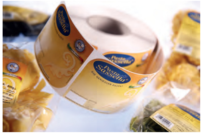
Self-adhesive shape-punched label for pasta