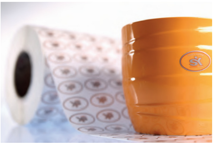
Self-adhesive brand label for ceramics