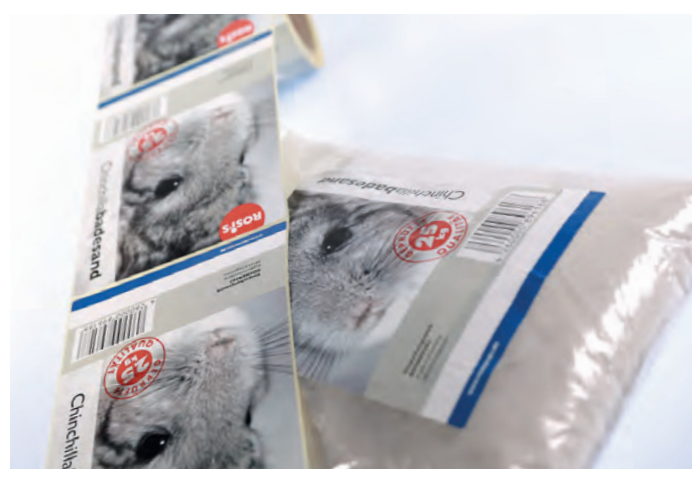
Self-adhesive display label for animal supplies