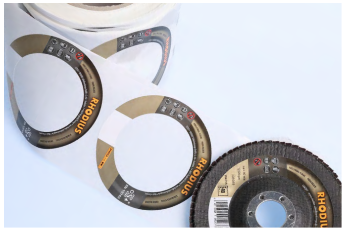
Self-adhesive, punched tag label for tools