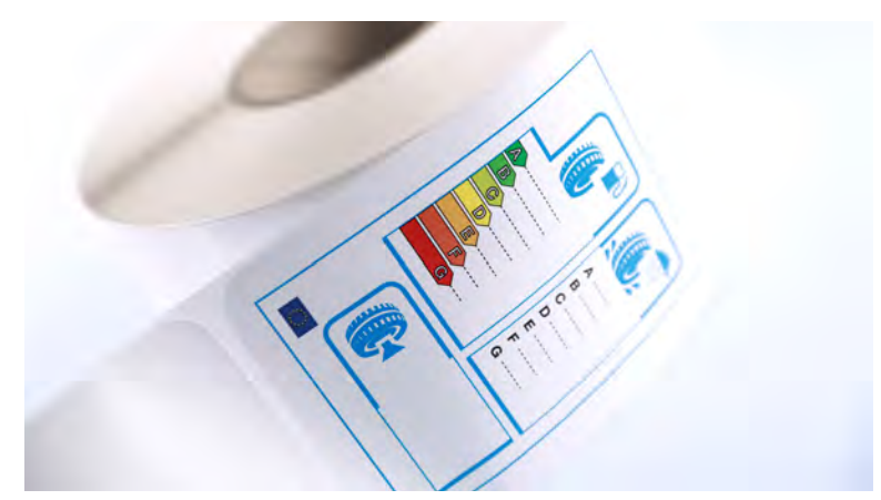
Self-adhesive label with special adhesive for labelling of tyres

We can offer you numerous labelling solutions to perfectly match your application. Label materials and adhesives are constantly improving through our innovations. Talk to us – we know the market better than most!